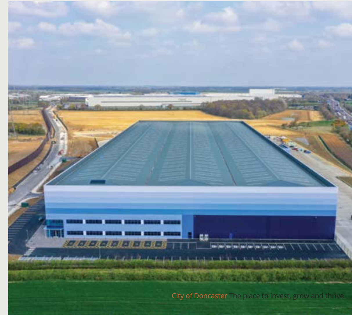
City of Doncaster The place to invest, grow and thrive