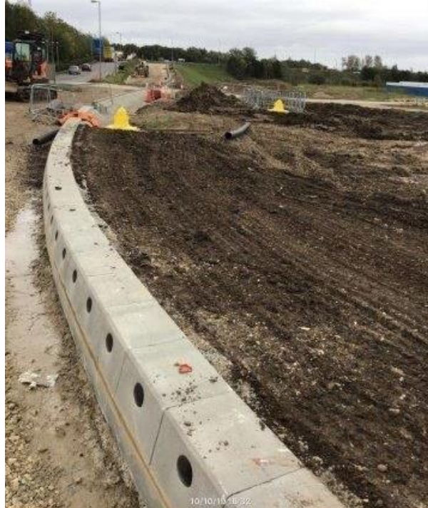
Combined drainage and kerbing at the slip road tie in