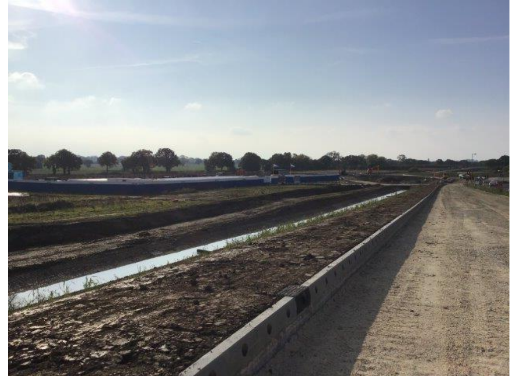
Work on widening the slip road progressing well