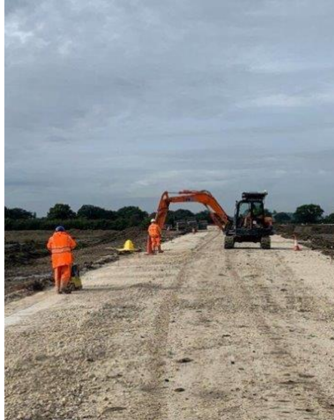
Link road preparation works in progress