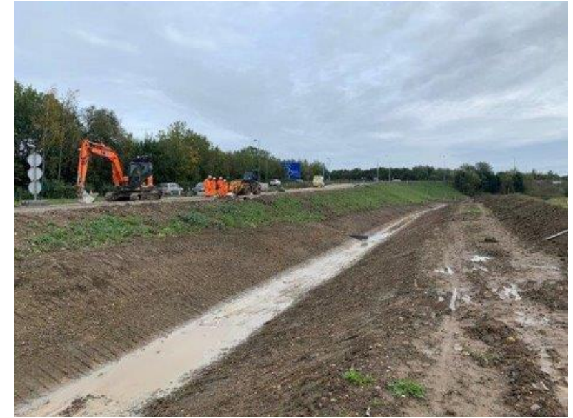
Swale drainage works adjacent to the new slip road